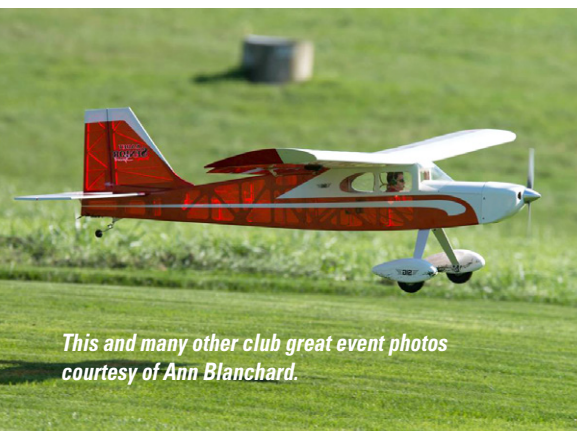
This and many other club great event